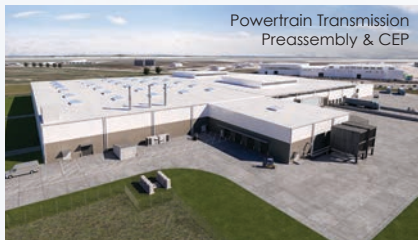
Powertrain Transmission Preassembly & CEP