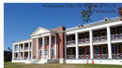
Hurricane Sally DB RFP and PCAS NAAS Pensacola

Founded in 1987, Schmidt Consulting Group - a small-business , specializing in multi-disciplined engineer design solutions for Public, Private, and Commercial clients - is a leader in Department of Defense design consulting.