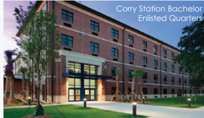
Corry Station Bachelor Enlisted Quarters