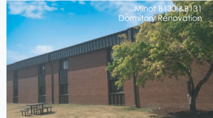
Minot B130 & B131 Dormitory Renovation