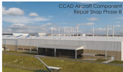
CCAD Aircraft Component Repair Shop Phase III