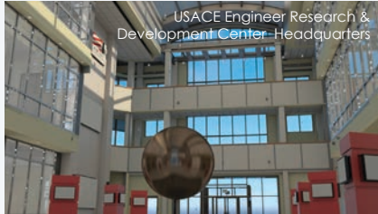
USACE Engineer Research & Development Center Headquarters