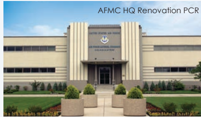
AFMC HQ Renovation PCR